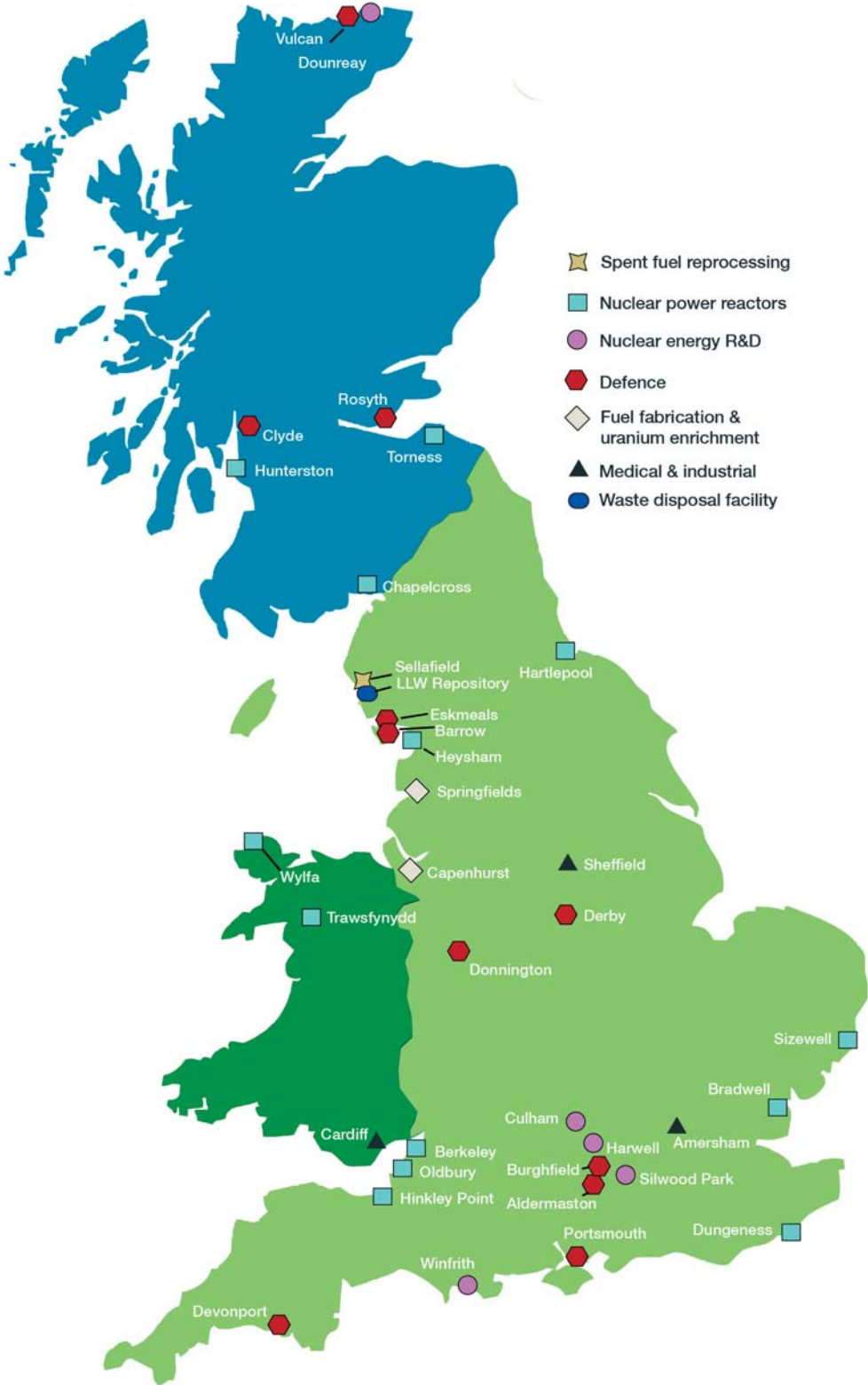
Figure 1: Major waste producers' sites

Notes: There are no major waste producer sites in Northern Ireland.